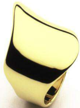
CYCLADIC GOLD RING