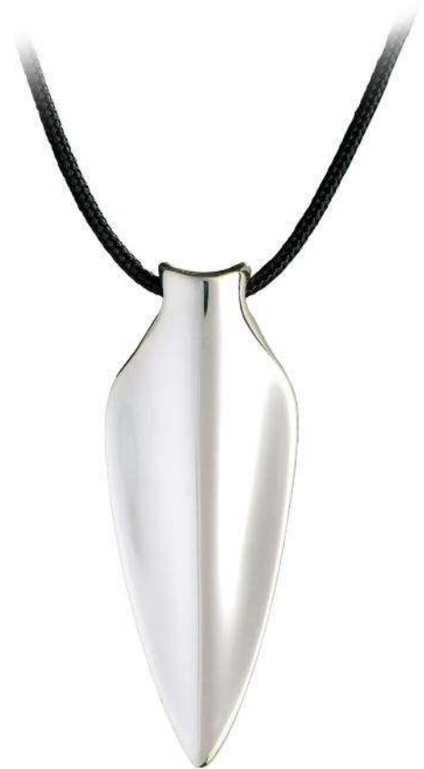
SPEAR TIP SILVER PENDANT