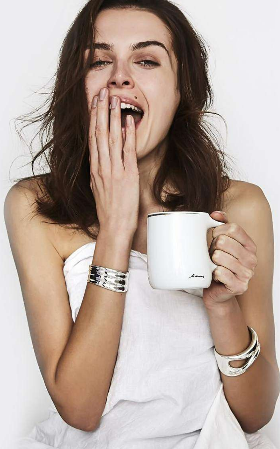
AEOLIAN SILVER BRACELET THE INFINITY SILVER BRACELET