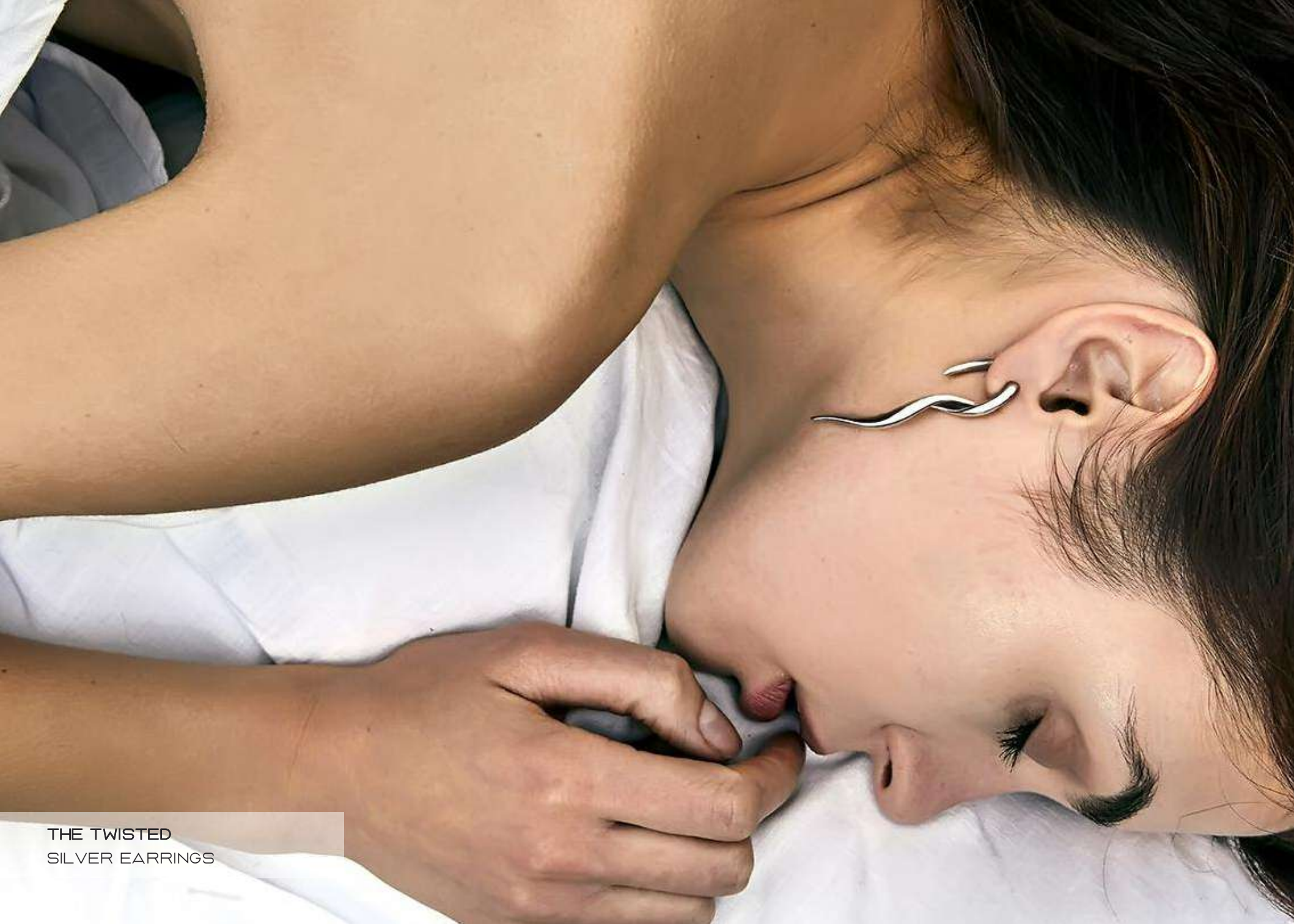
THE TWISTED SILVER EARRINGS