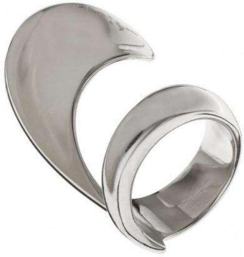
ANEMOS SILVER RING