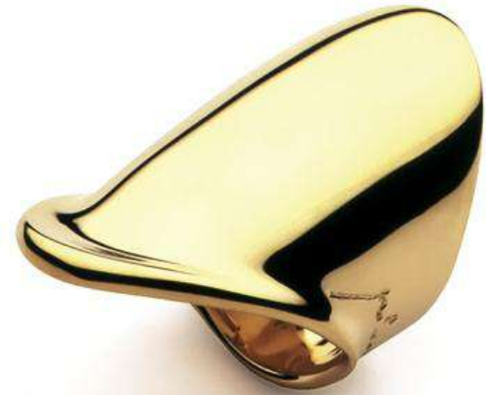
DELOS GOLD RING