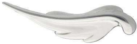
E-WING SILVER EARRING