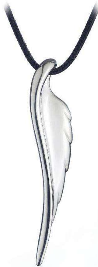
WING SILVER PENDANT