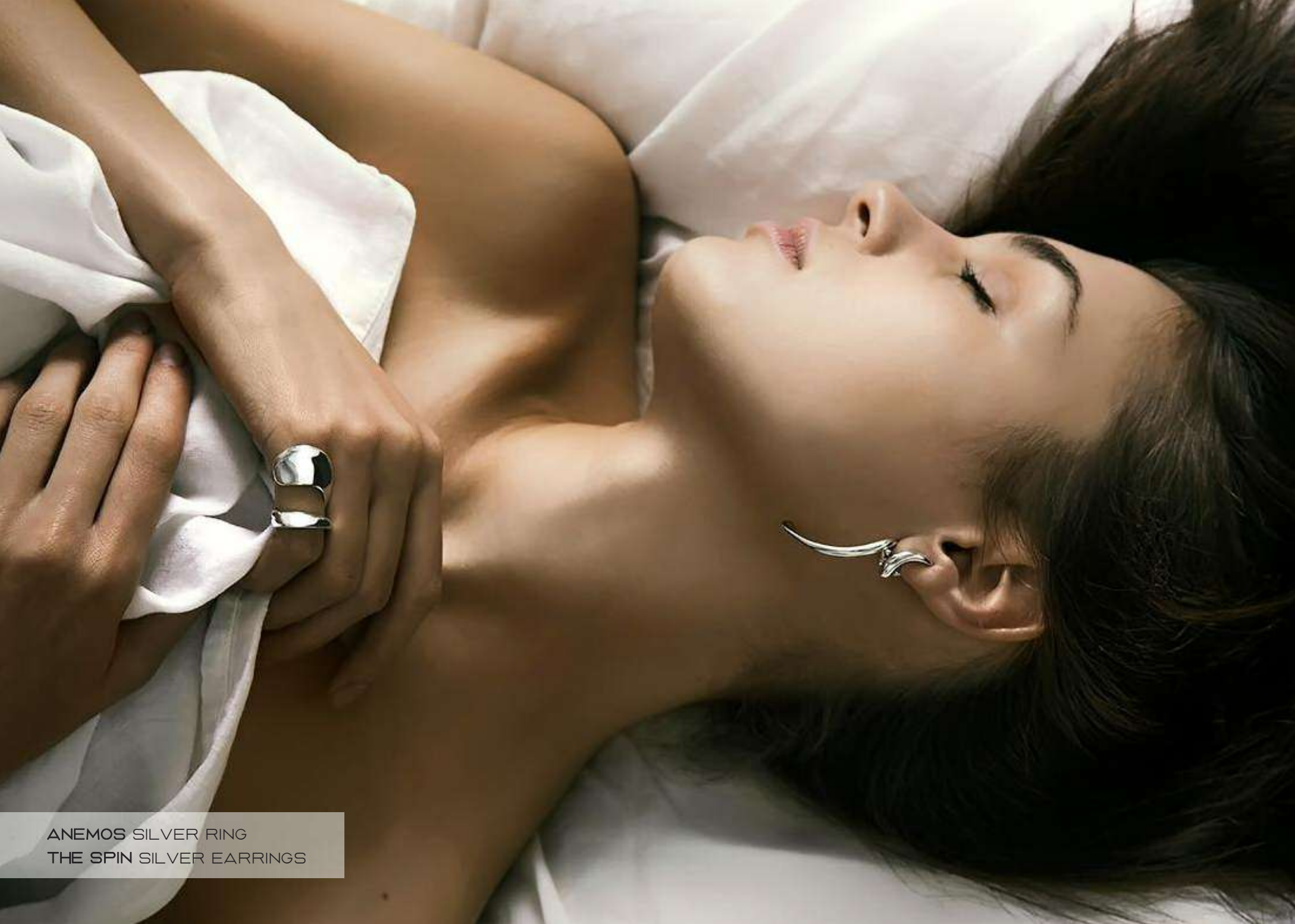
ANEMOS SILVER RING THE SPIN SILVER EARRINGS