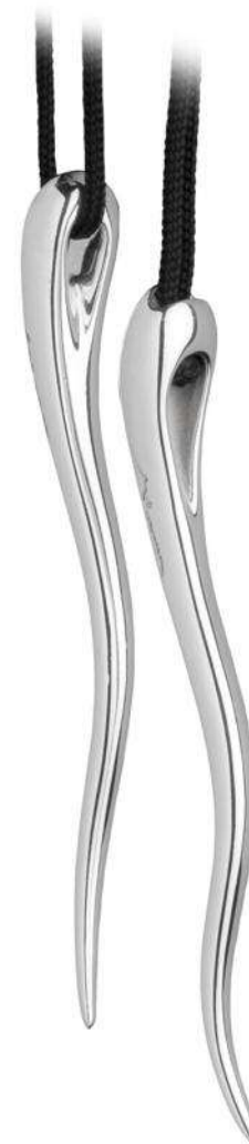
BIG PEPPERS SILVER PENDANT