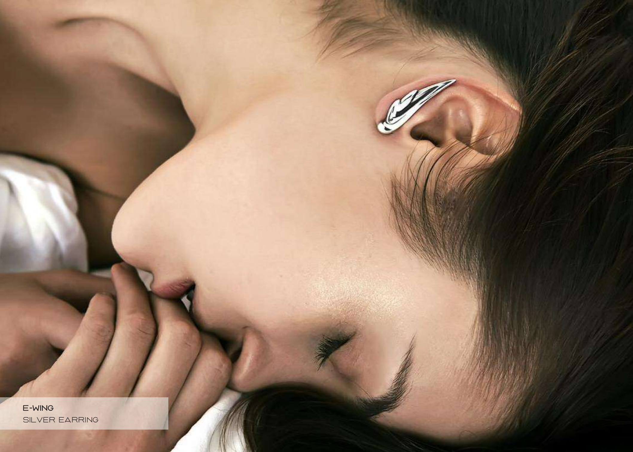
E-WING SILVER EARRING