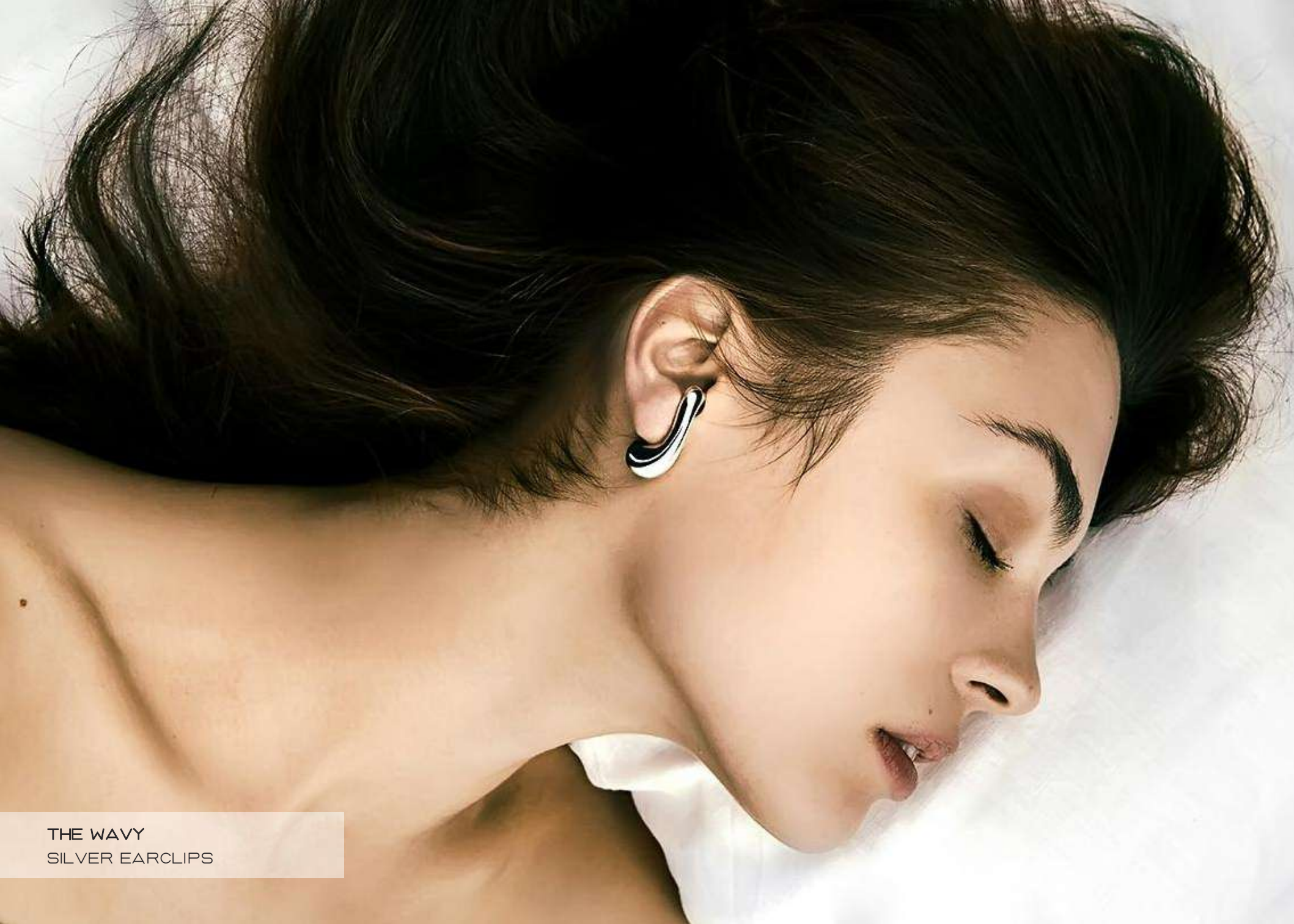
THE WAVY SILVER EARCLIPS