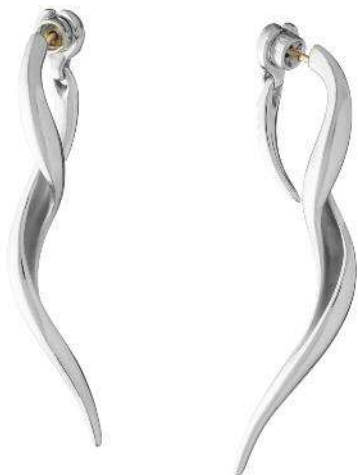
THE TWISTED SILVER EARRINGS