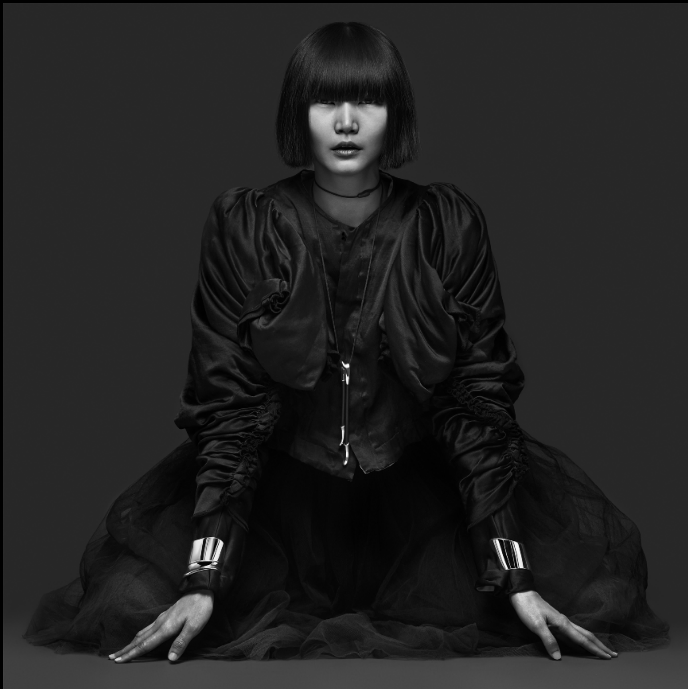
THE CLASSIC SILVER CUFF | SILVER & RUBBER NEOPRENE PENDANT THE CUFF SILVER BRACELET | RIGHT HAND SILVER CUFF