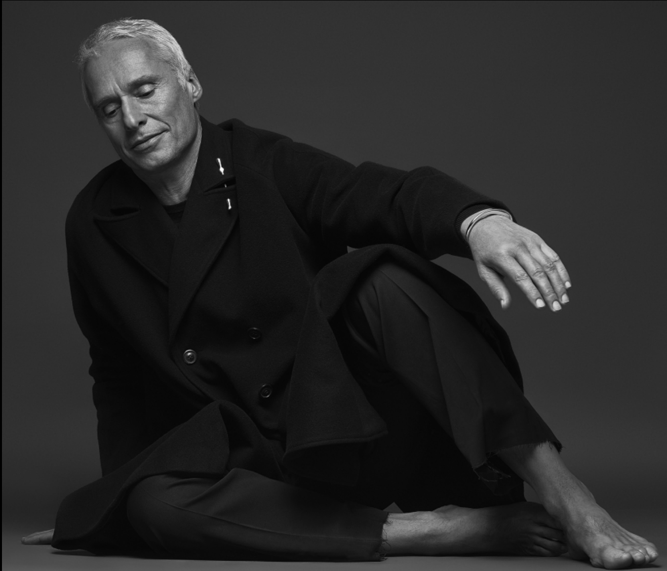
SILVER & GOLD BROOCH | CRESCENT SILVER BRACELET