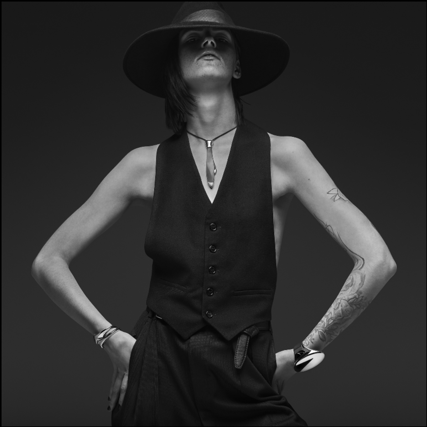
DENNY'S SILVER & RUBBER TIE | STAR SILVER BRACELETS | OVAL SILVER BRACELETS