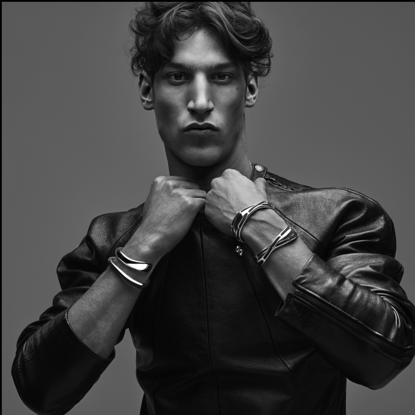
CROSS CORD SILVER BRACELET | SILVER BRACELET | CRESCENT SILVER BRACELET