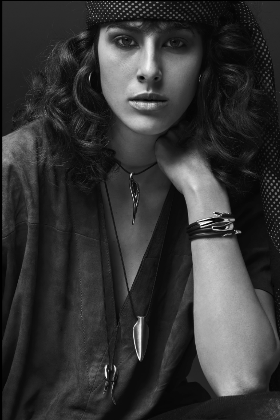
SPEAR TIP SILVER PENDANT | WING SILVER PENDANT | SILVER & RUBBER BRACELET WISHBONE SILVER & RUBBER BRACELET | HERCULES KNOT SILVER PENDANT