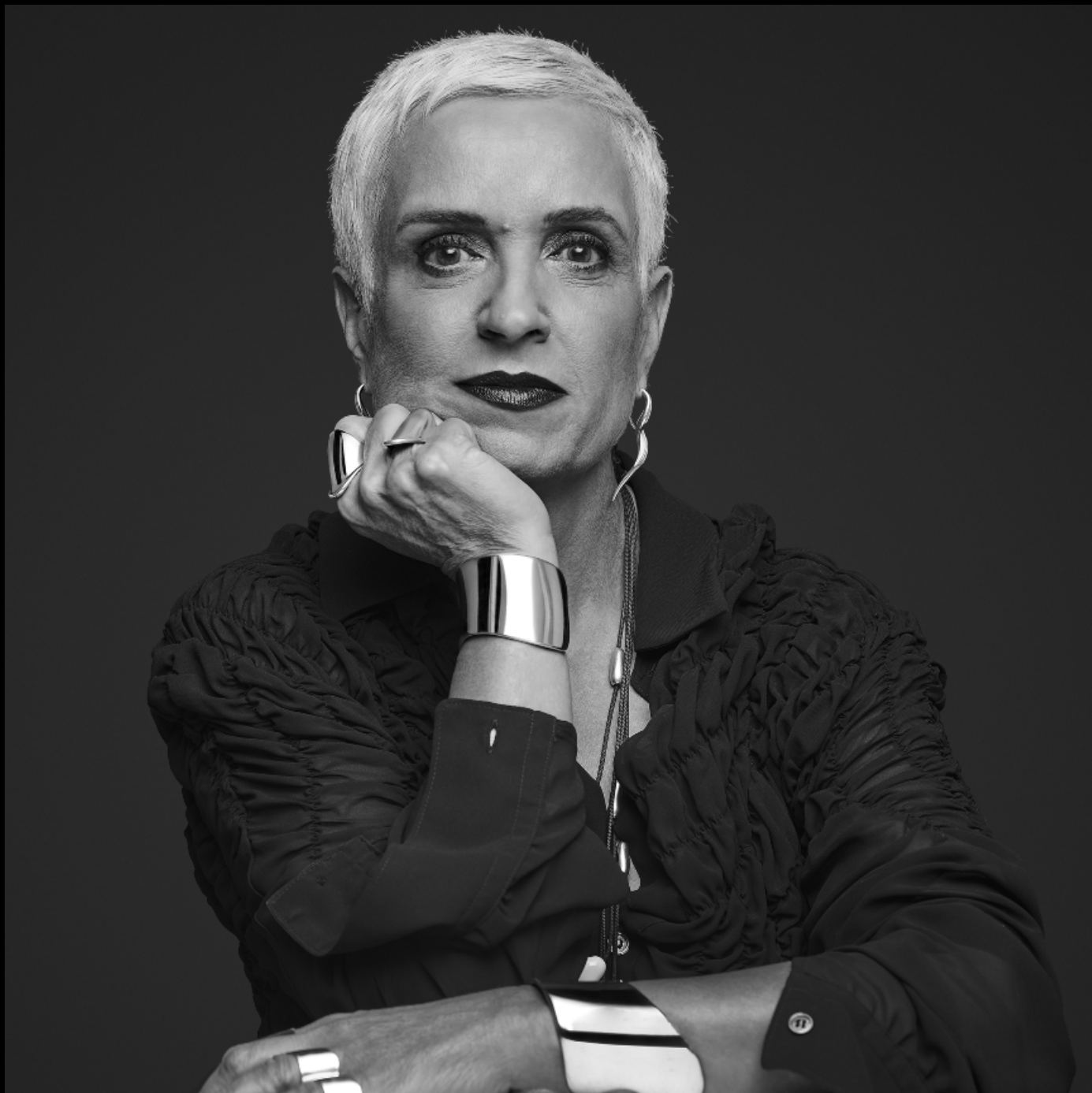
THE CLASSIC SILVER RINGS | DELOS SILVER RING | RIGHT HAND SILVER CUFF THE CLASSIC SILVER CUFF | THE TWISTED EARRINGS