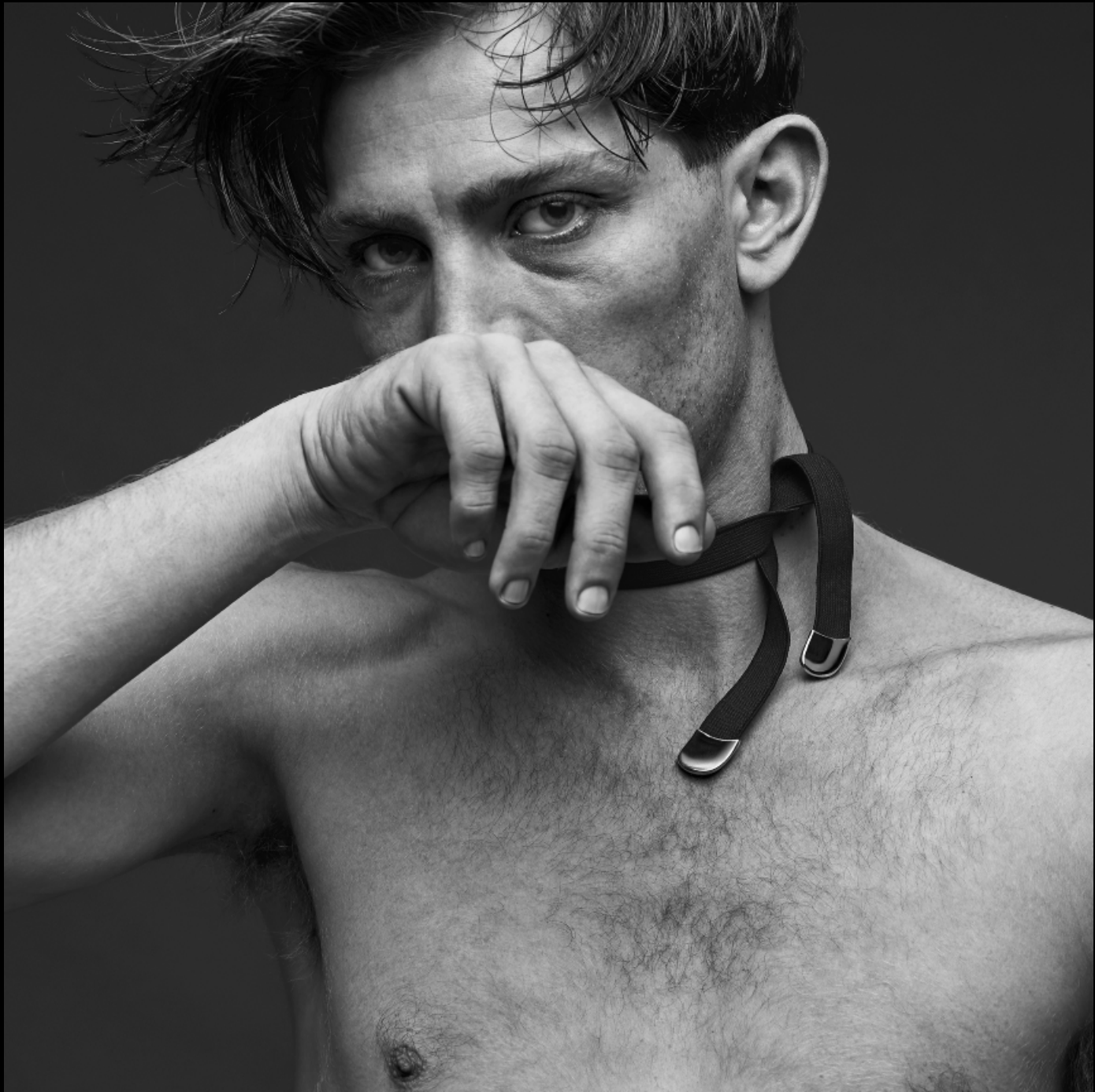
RUBBER RIBBON WITH SILVER ENDS