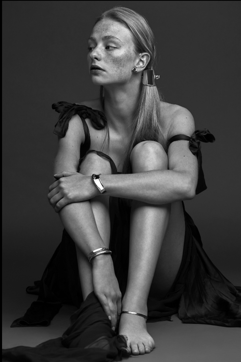
CRESCENT SILVER BRACELET | SILVER HAIR CUFF | THE CUFF SILVER BRACELET SILVER ANKLET | GOLD EARCUFFS