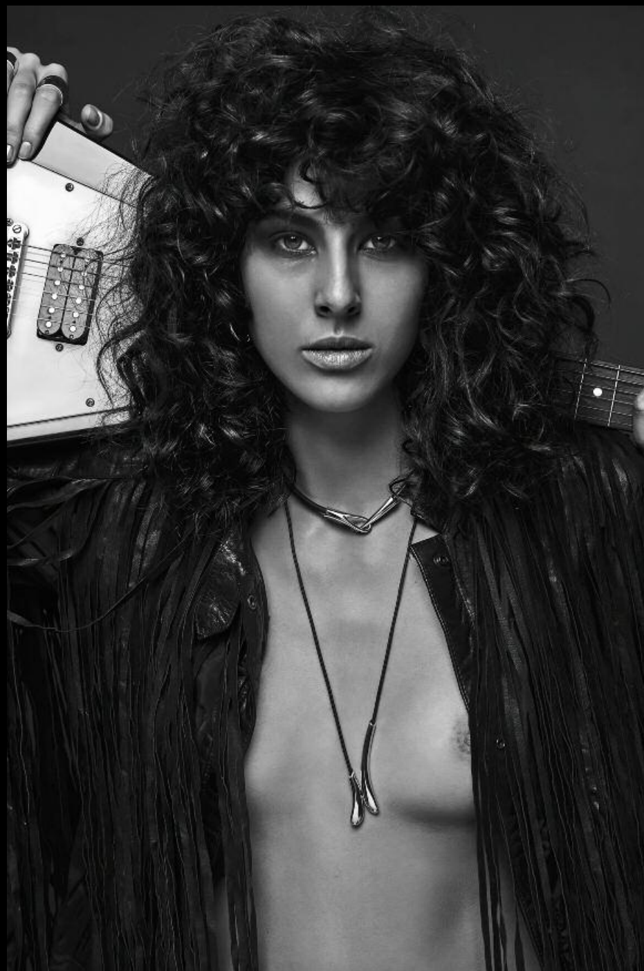
HOOKED ON SILVER & RUBBER CHOKER | LOVING SILVER PENDANT | THE CLASSIC SILVER RINGS