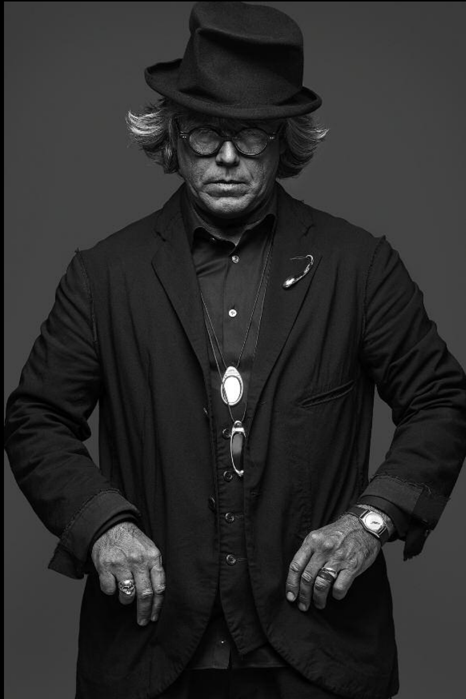
JOLLY ROGER SILVER RING | SILVER BROOCH | SILVER MAGNIFIED LENS MIRROR SILVER PENDANT | THE MINAS WATCH | SILVER RINGS