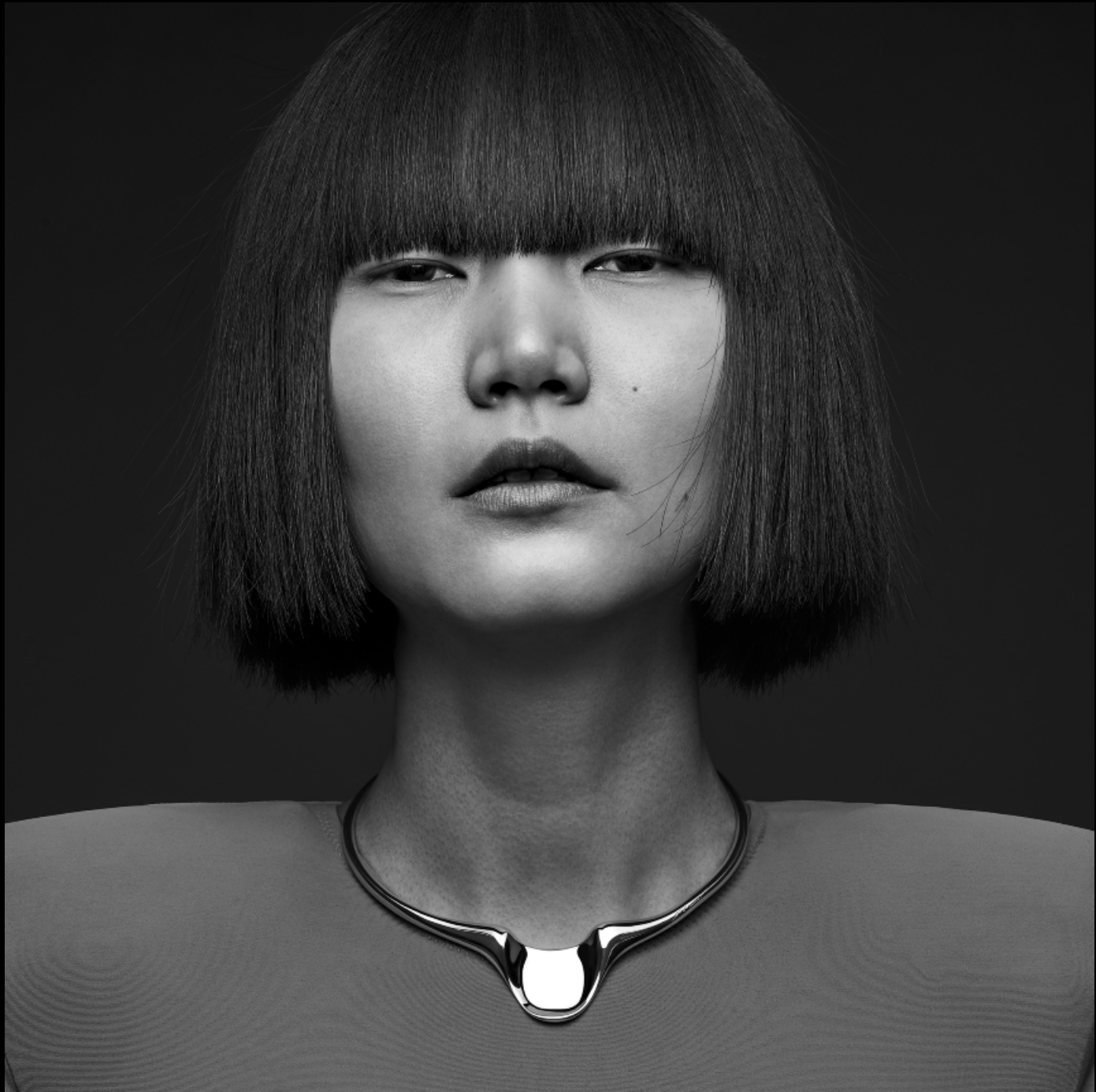
THE C183 SILVER CHOKER