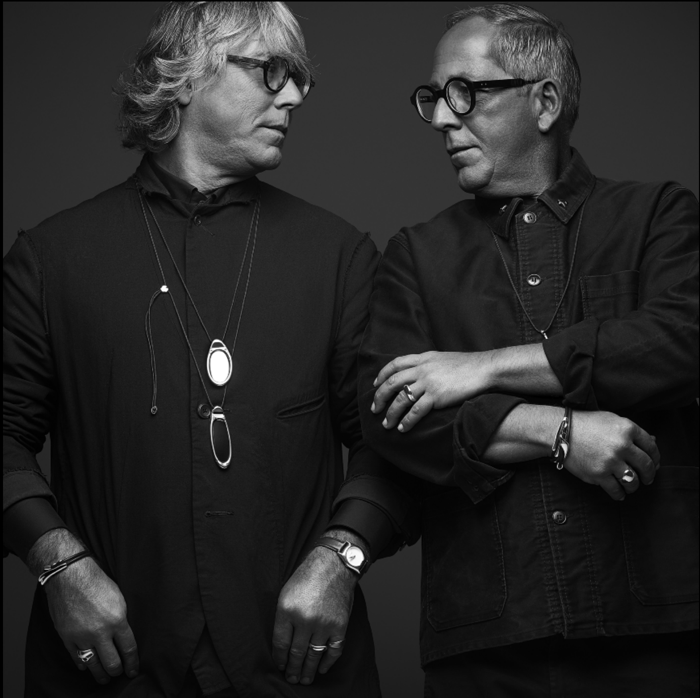
JOLLY ROGER SILVER RING | SILVER & RUBBER BRACELET | SILVER MAGNIFIED LENS MIRROR SILVER PENDANT | THE MINAS WATCH | SILVER RINGS