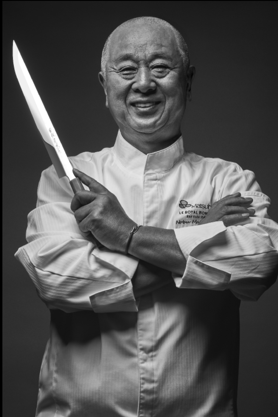
B WAVE - SILVER BRACELET