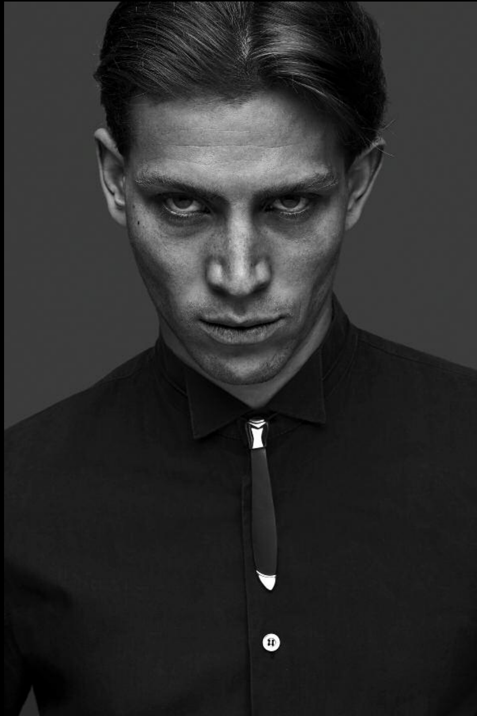
DENNY'S SILVER & RUBBER TIE