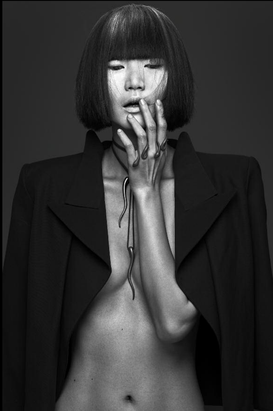
THE BLACK MAMBA RINGS | BIG PEPPERS SILVER PENDANT