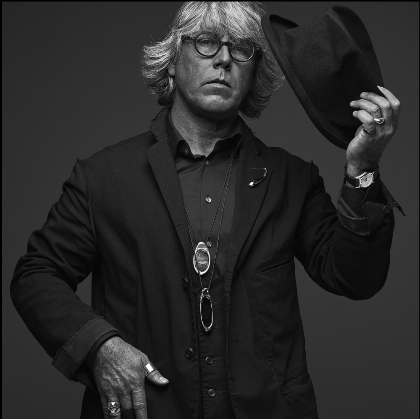
JOLLY ROGER SILVER RING | SILVER BROOCH | SILVER MAGNIFIED LENS MIRROR SILVER PENDANT | THE MINAS WATCH | SILVER RINGS