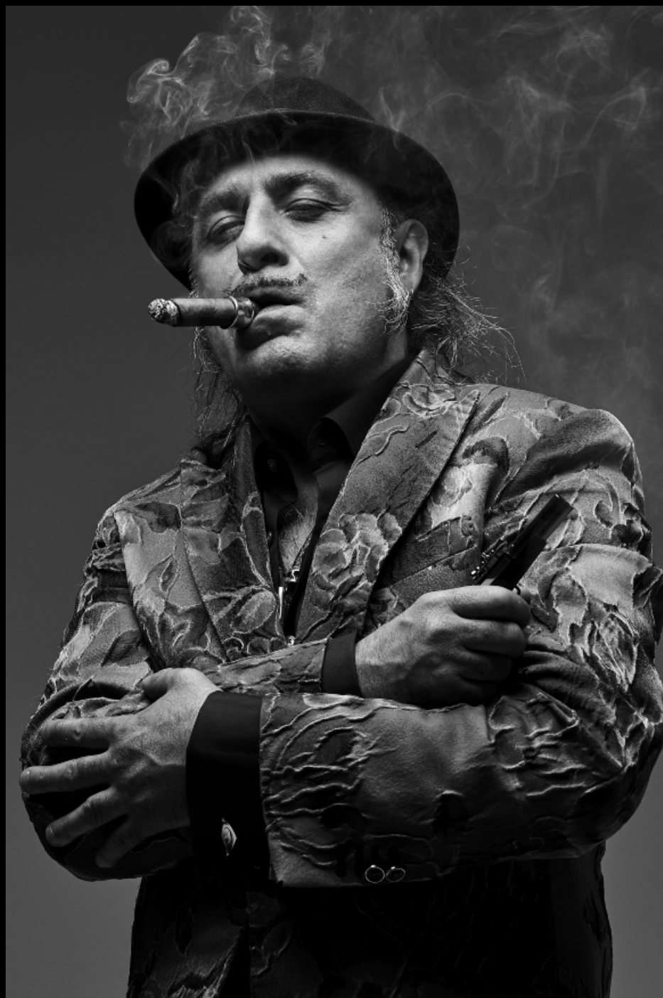
TONINO SILVER CUFFLINKS | SILVER CIGAR RING