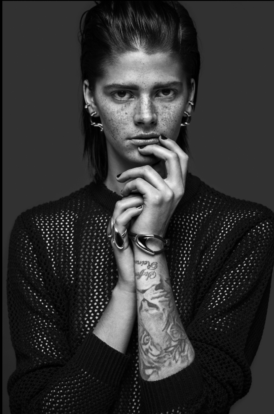
STAR SILVER BRACELET | THE MIRROR SILVER BRACELET | LOOP SILVER & RUBBER BRACELET SILVER & RUBBER NEOPRENE EARRINGS | SILVER RING