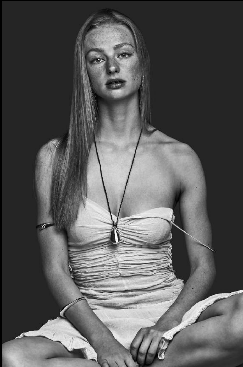
CRESCENT SILVER BRACELET | SILVER POUCH PENDANT | SILVER & RUBBER BRACELET