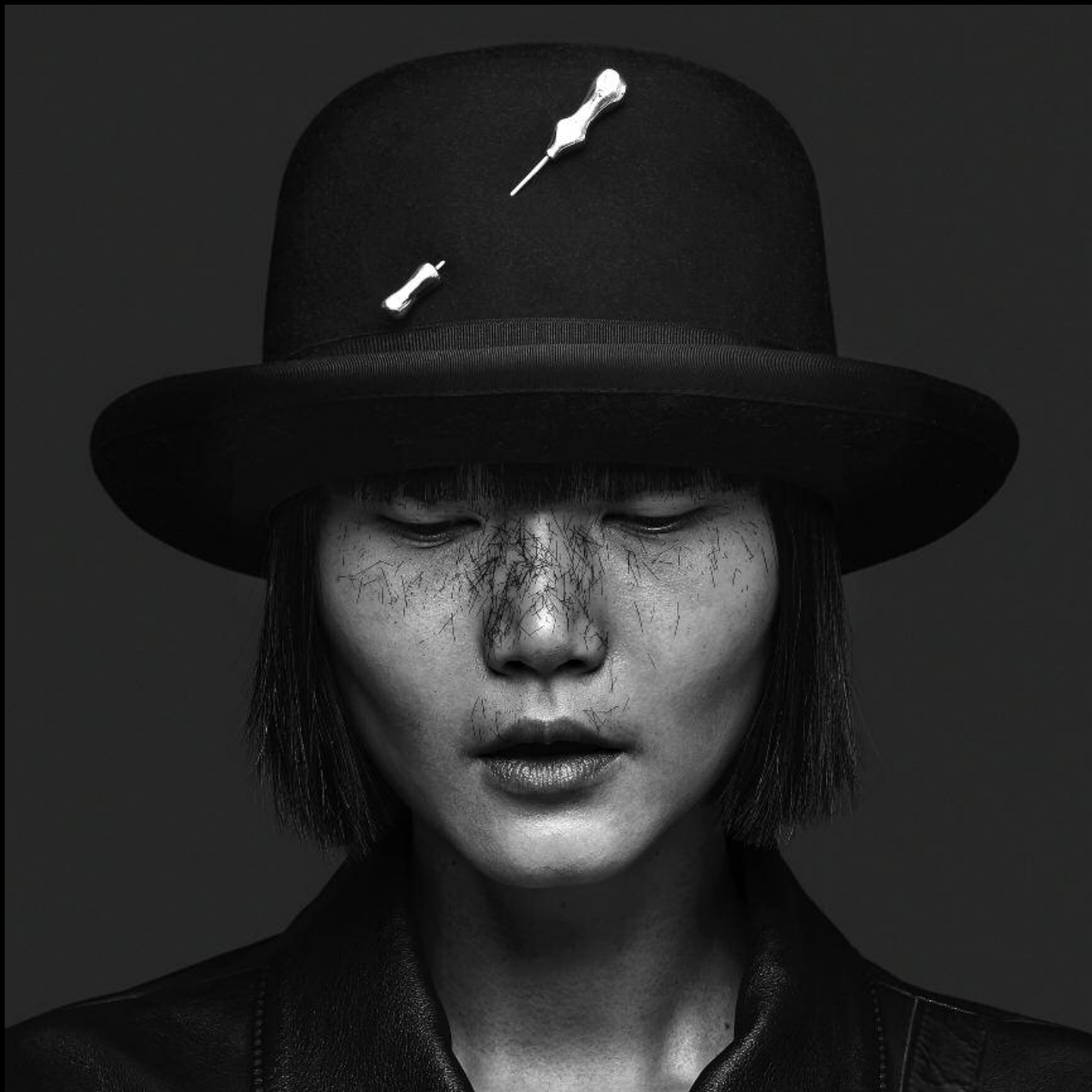
SILVER & GOLD BROOCH