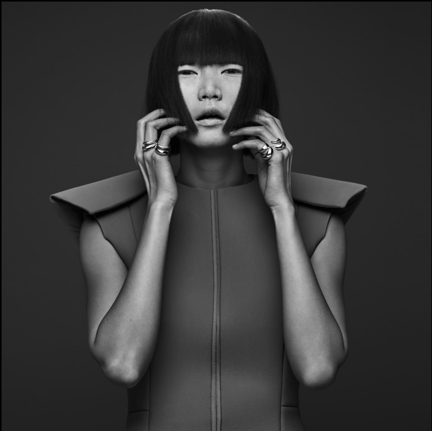
THE DOUBLE SILVER RING | TWISTED LOVE SILVER RING