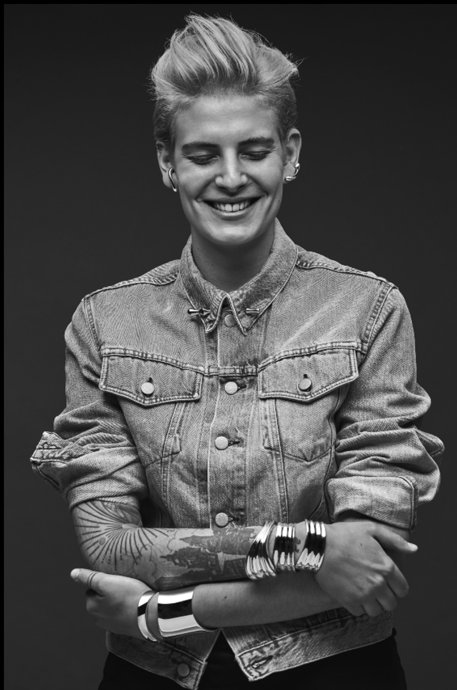
THE CLASSIC SILVER CUFF | WAVE SILVER BRACELET | AEOLIAN BRACELET LONG CLASP SILVER EARCLIPS | THE 800 SILVER EARRINGS