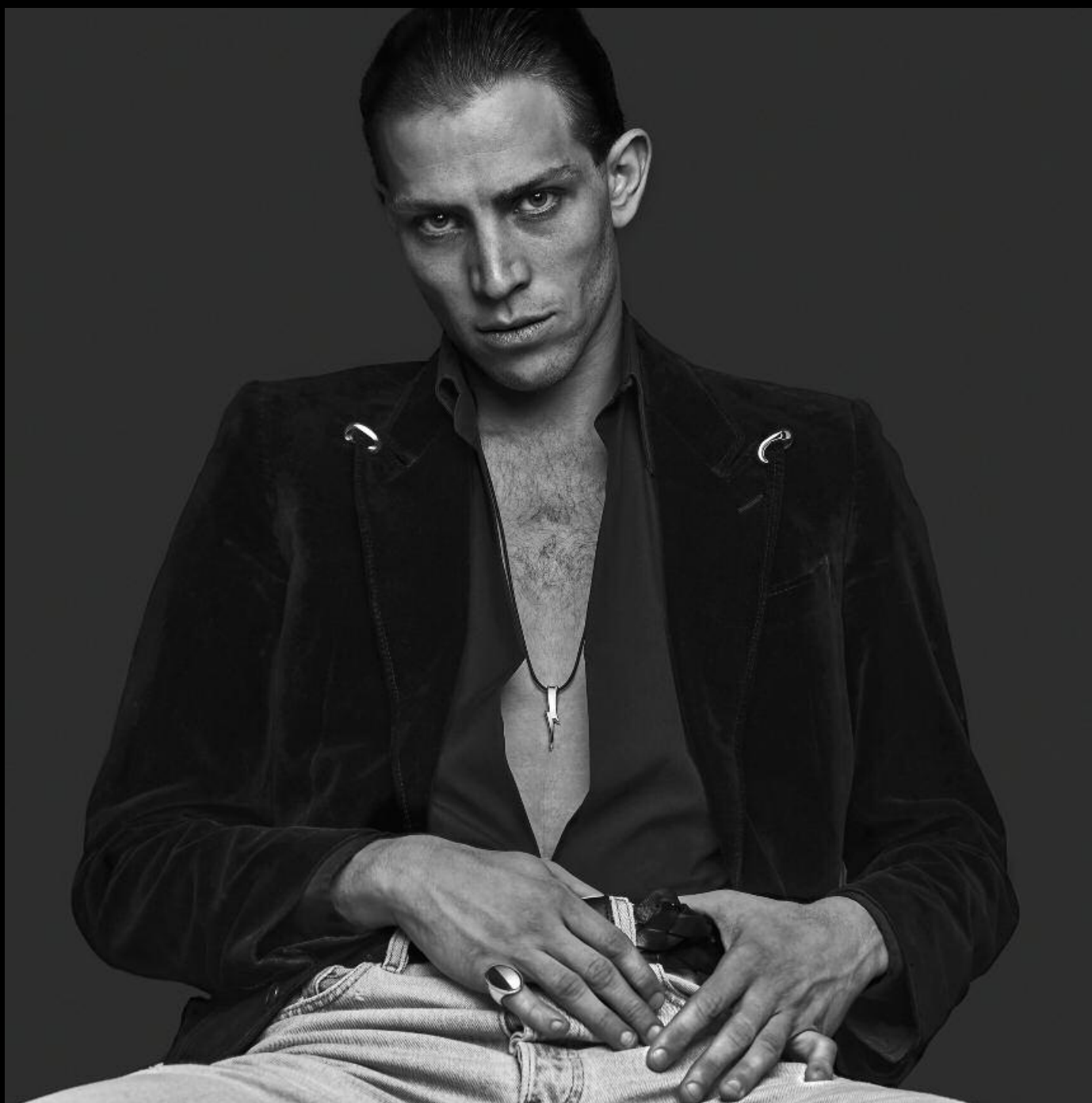
SILVER RING | LIGHTING SILVER PENDANT | LONG CLASP SILVER EARCLIPS